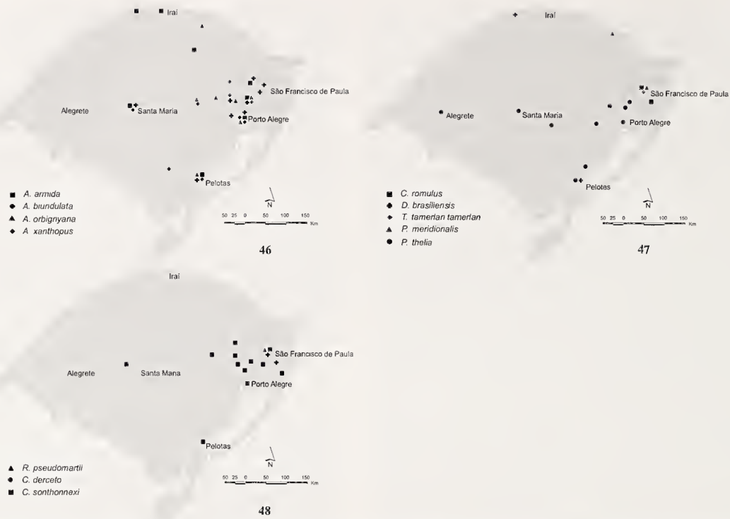
FIGS. 46–48. Distribution maps of Arsenurinae of Rio Grande do Sul, Brazil. 46. Arsenura armida , Arsenura biundulata , Arsenura orbignyana , and Arsenura xanthopus . 47. Caio romulus , Dysdaemonia brasiliensis , Titaea tamerlan tamerlan , Paradaemonia meridionalis , and Paradaemonia thelia . 48. Rhescyntis pseudomartii , Copiopteryx derceto , and Copiopteryx sonthonnaxi .